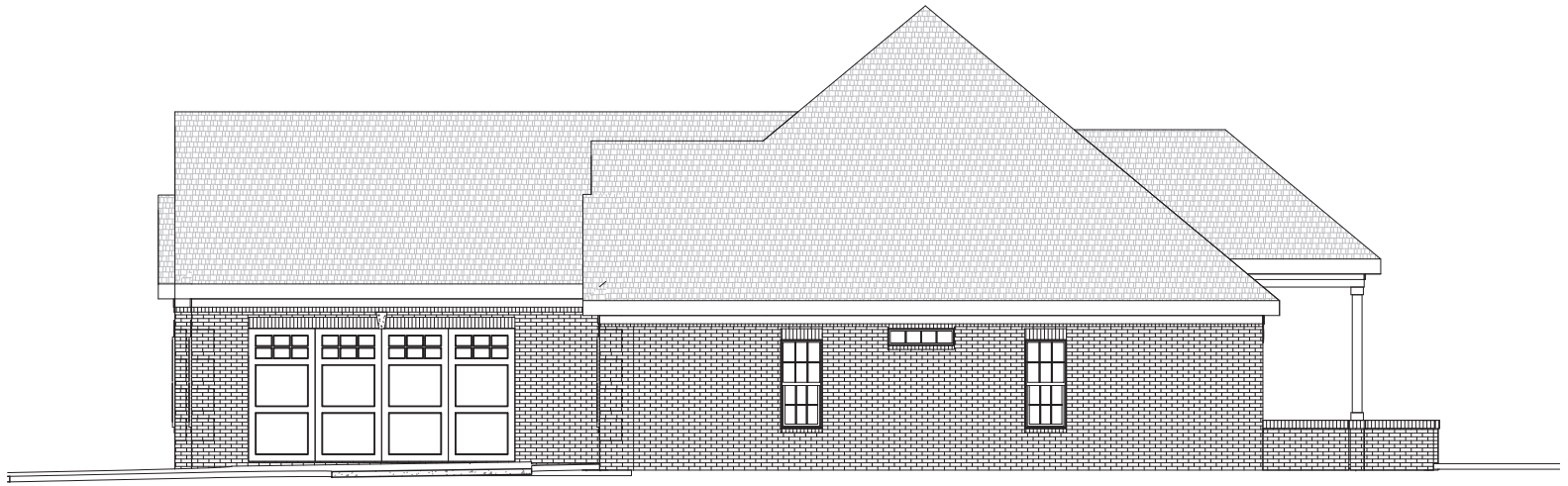
① Right Elevation 1/4" = 1'-0"